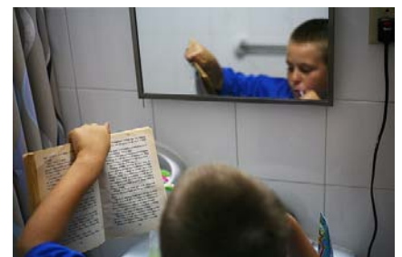
Do you know a reader THIS committed?