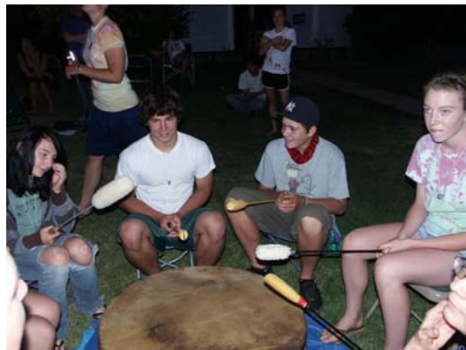
Learning to drum with the tribe members.