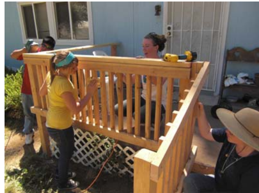
Sanding new deck rails.