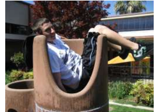
FISH has time for reflection