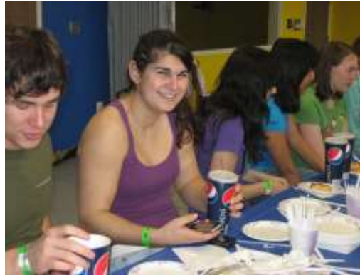
FISH provides opportunities for mentoring, building friendships, discovering Christ.

If you are in the 9th, 10th, 11th or 12th grade, FISH may be for you.