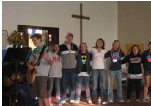
FISH includes worship

There are times of singing, playing, community worship, and private prayer. There is a time to share with others in a safe, supportive environment. The FISH weekend is structured but each participant is given the opportunity to be an individual.