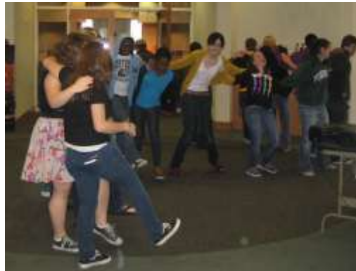
FISH has times of active fun